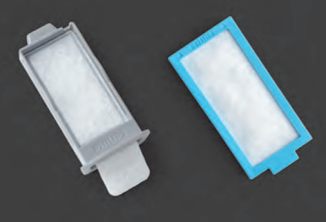
Reusable pollen filter