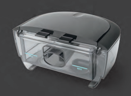
Water tank with lid