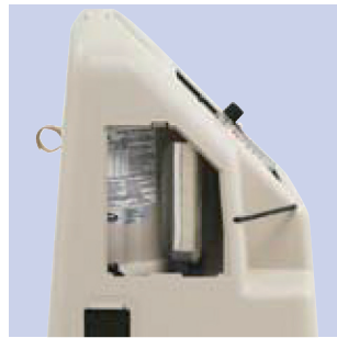
Only one filter to change when dirty