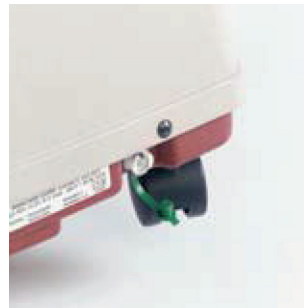
HomeFill® connection port