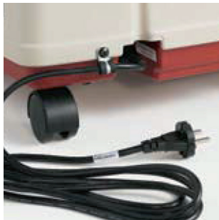
Secured power cord connection