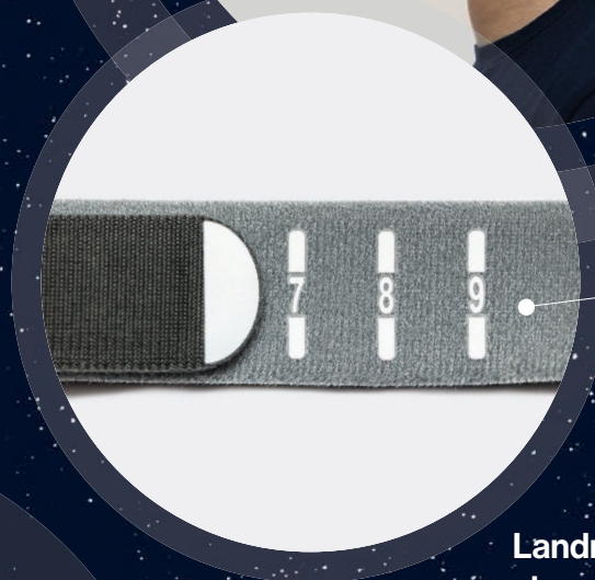
Landmarks on the lower straps